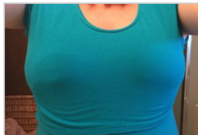
left has milkie's softies contoured nursing pad